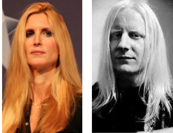
ANN COULTER & JOHNNY WINTER

Ann: I've held off on writing about soccer for a decade — or about the length of the average soccer game — so as not to offend anyone. But enough is enough. Any growing interest in soccer can only be a sign of the nation's moral decay.