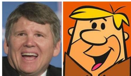
WILLAMETTE & WILMA'S FRET DAN HAWKINS & BARNEY RUBBLE